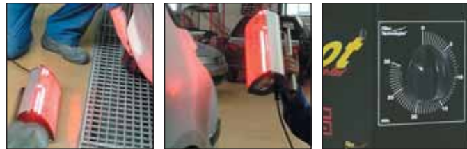
For hard-to-get-at places